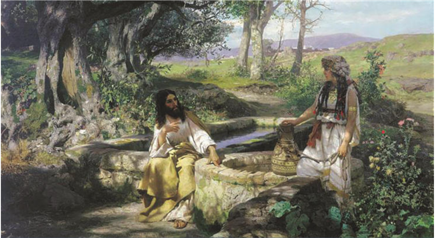
Christ and the Samaritan Woman by Henryk Siemiradzki (1890)