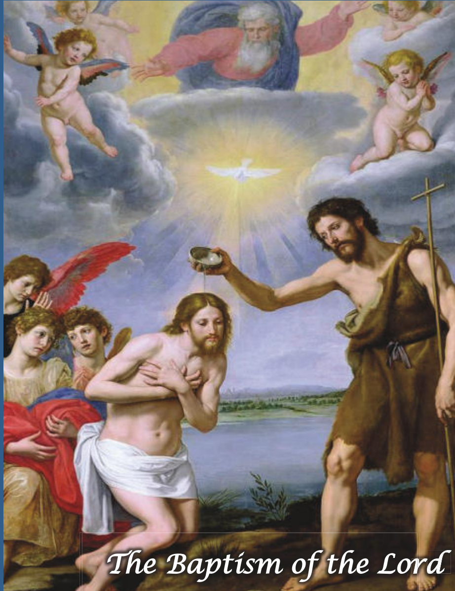
The Baptism of the Lord