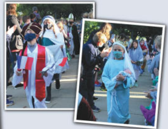
BLESSED SACRAMENT SCHOOL SECOND GRADE SAINT PARADE