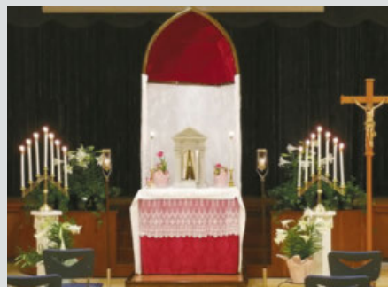
Holy Thursday Altar of Repose