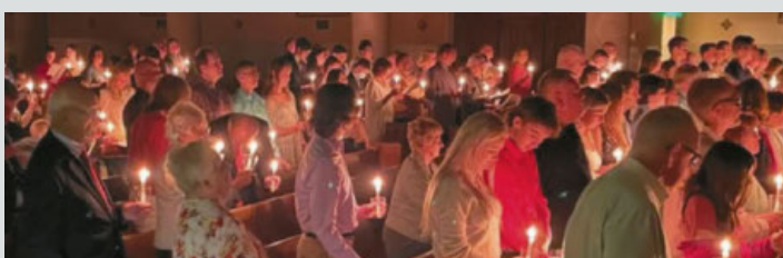
Easter Vigil by Candlelight