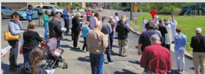
Good Friday Outdoor Way of the Cross