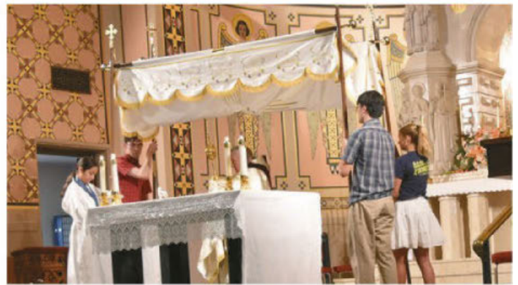
Corpus Christi Parish Celebration

Preparation for first reconciliation, first holy communion, and confirmation takes two years. Diocesan guidelines require that children have one full year of religious instruction prior to the year in which they expect to celebrate sacraments. If you have children in public school grade 1, please don't wait until next year to begin their religious education. If you have children in seventh grade, and they are not currently receiving religious instruction, please contact the Formation Office now.