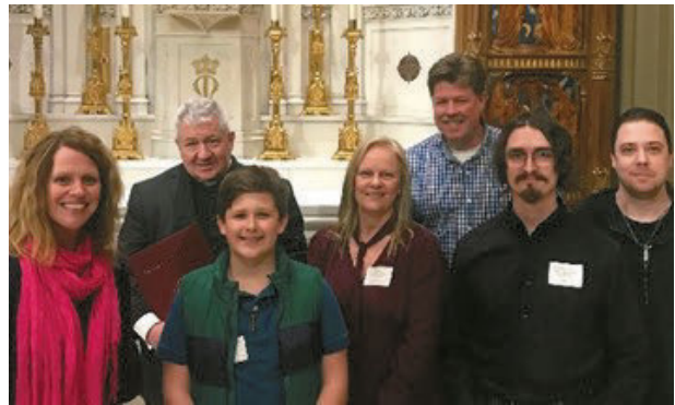
Photo of last year's RCIA participants.