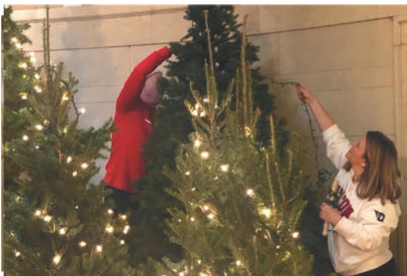
Uof D Alumnae Decorate the Church