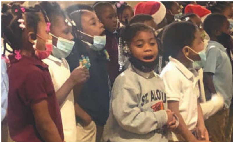
Students Performing at the School Concert