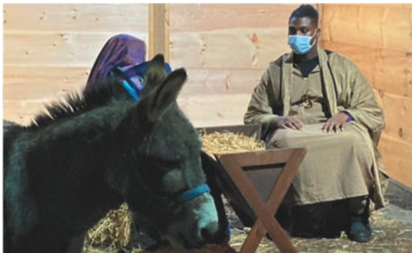
Live Nativity—December 16