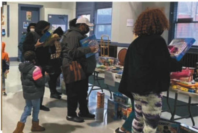
Christmas Gift Shop—December 18