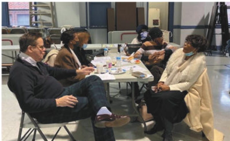
December 19 Synodal Listening Session