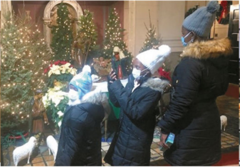
One Last Look at the Christmas Story