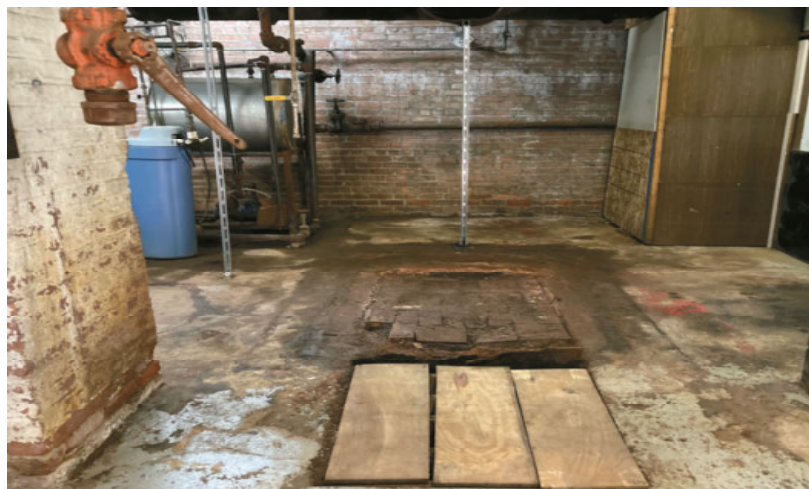
Phase1 Complete—Old Boiler Removed