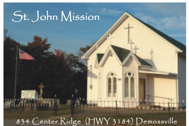
St. John Mission