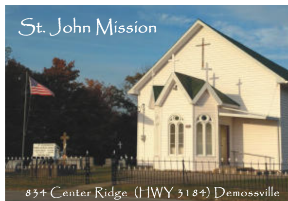
St. John Mission

“‘Lord, Lord, open the door for us!’ But he said in reply, ‘Amen, I say to you, I do not know you.’” - Mt 25:11-12