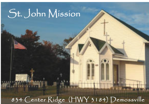
St. John Mission

“While I am in the world, I am the light of the world..” Jn 9:5