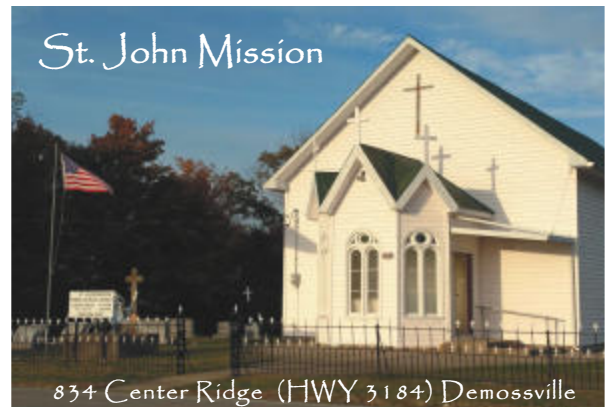
St. John Mission