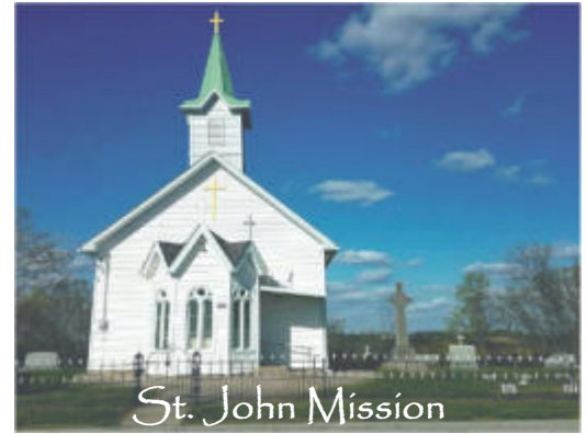
St. John Mission