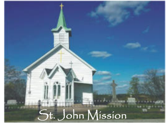
St. John Mission

834 Center Ridge (HWY 3184) De Mossville, KY 41033