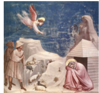
The Dream of Joachim Giotto 1305

And Joachim went down and called his shepherds, saying, “Bring me hither ten she-lambs without spot or blemish, and they shall be for the Lord my God; and bring me twelve tender calves, and they shall be for the priests and the elders; and a hundred goats for all the people.”