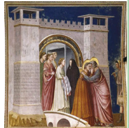
The Meeting of Ss Joachim and Anne at the Golden Gate

our stories of faith and solid, mature love.