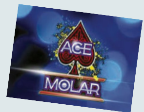
Ace Molar Sunday 6-9 pm

Questions - contact Rosemarie Sisler at (440) 854-6001 or rsisler@smmwillowick.org