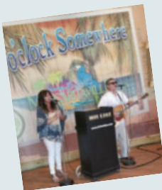
Hit List Thursday 7-10 pm