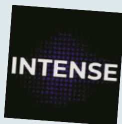
Intense Friday 7-10 pm