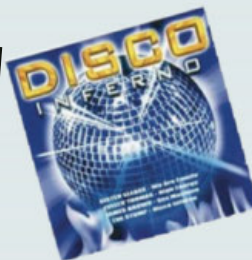
Disco Inferno Saturday 7-10 pm