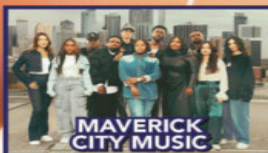
MAVERICK CITY MUSIC