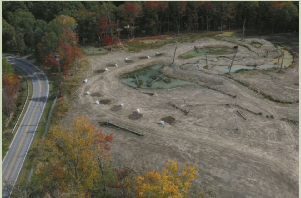
A drone shot of the former Padua soccer fields shows how the property looked when transferred to Cleveland Metroparks last December.