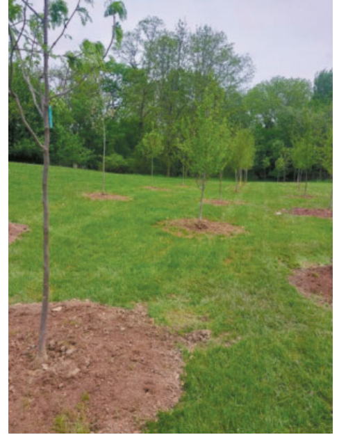
Visitors to Walters Grove now see many new trees in the park.

In addition to providing beauty, shade and a habitat for wildlife, the trees will also help dissipate the volume and flow of stormwater.