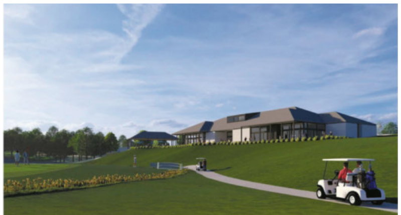
The layout offers a view of the golf course’s picturesque hillside.

The city expects construction of the facility to be completed in 2025, the same year the golf course will be celebrating its 100th anniversary.