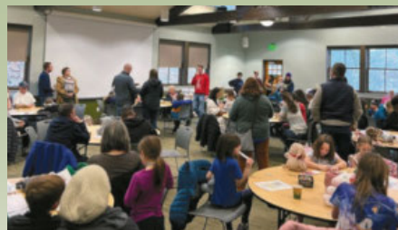
Hundreds attended WinterFest.

Through the city's Community Services and Economic Development Office, a