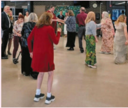
Seniors dance after dinner.

Donna Smallwood Activities Center and Parma City School District partnered to bring back the pre-pandemic event. Held