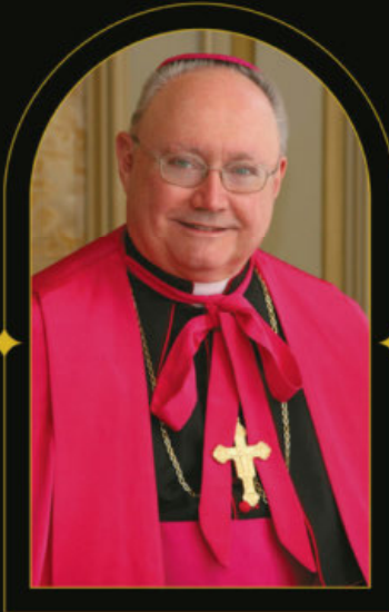
Ordained on June 29, 1975 by Pope St. Paul VI