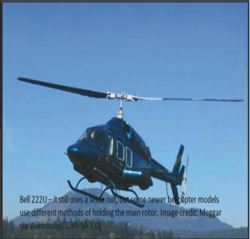
Bell 222U – it still uses a Jesus nut, but some newer helicopter models use different methods of holding the main rotor.

Parish Office: 724-872-6123 Church Email: hfamilywn@comcast.net Faith Formation: (Office at St Anne) 724-872-3486 Cell 724-787-1989