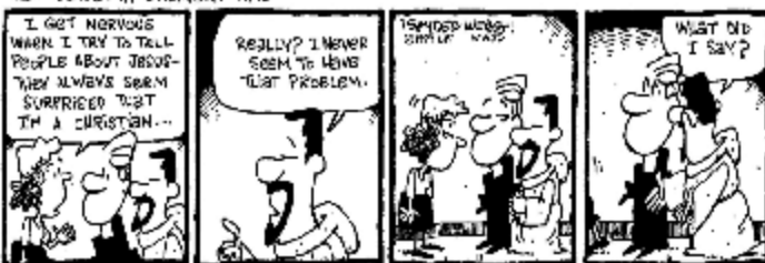
12th SUNDAY IN ORDINARY TIME

We remember fathers, grandfathers, and great grandfathers who are no longer with us but who live forever in our memory and nourish us with their love. Amen