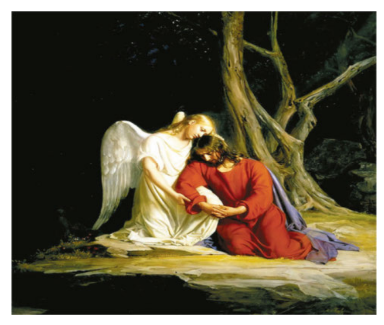
KEEPING DEATH BEFORE OUR EYES IN THIS MONTH FOR THE SOULS IN PURGATORY (& BEYOND) Part I