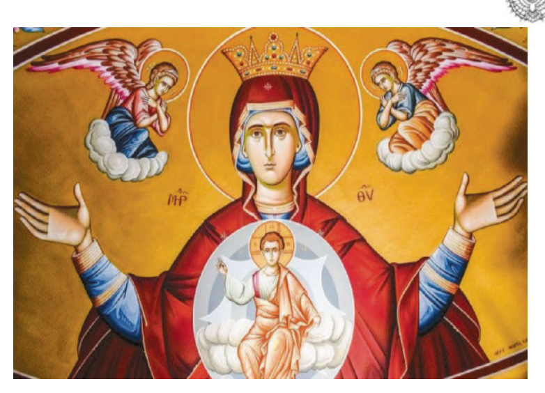
THE BLESSED VIRGIN MARY The TABERNACLE