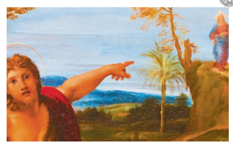
ADVENT 2023 LET US GET READY FOR THE SAVIOR Part I