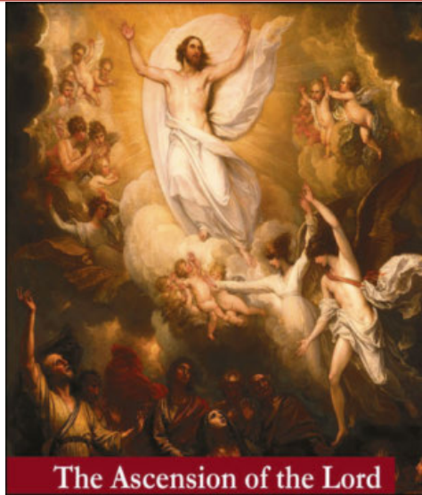
The Ascension of the Lord

Please Send Bulletin Submissions by 3PM Mondays to dre@holycomforterparish.org