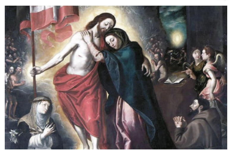
THE BLESSED VIRGIN MARY and THE RESURRECTION OF JESUS