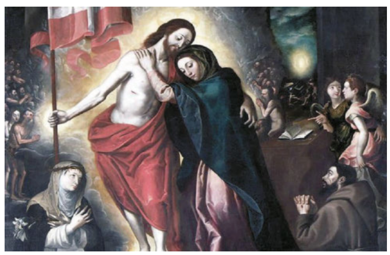
THE BLESSED VIRGIN MARY and THE RESURRECTION OF JESUS