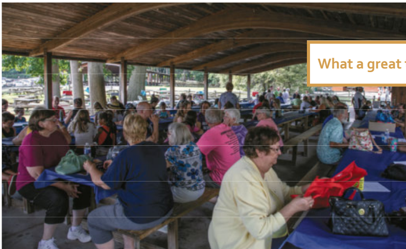
What a great turnout!!