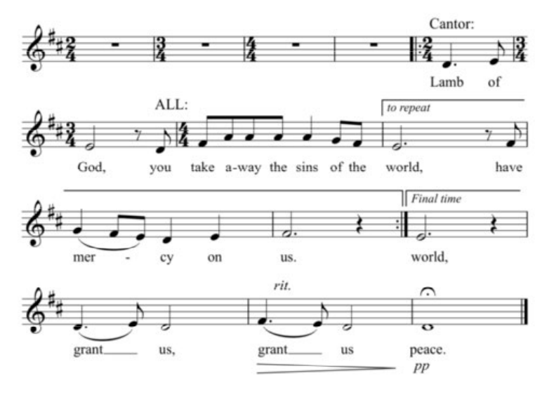
Music: Mass of Renewal, Copyright © 2010 GFTSMusic Publishing Company, Inc. www.massofrenewal.com. Administered by Music Services, Inc. www.musicservices.org. All rights reserved. Reprinted with permission: OneLicense A-702539.