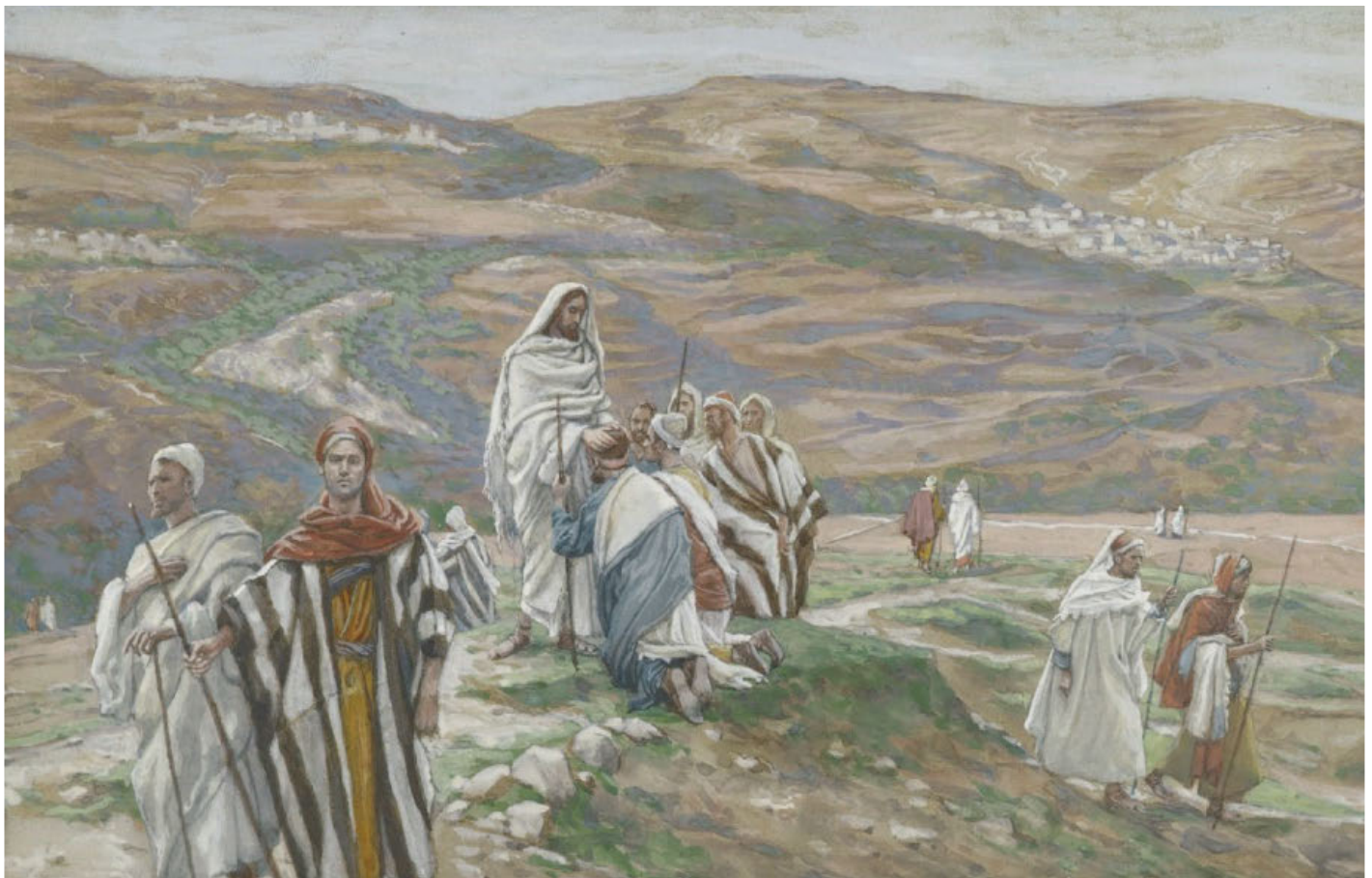
James Tissot (French, 1836-1902), He Sent Them Out Two by Two , c. 1886-1896. Opaque watercolor over graphite on gray wove paper (5 3/4 x 9 3/4 in.). Brooklyn Museum, NY. (No known copyright restrictions).