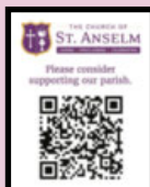
THE BODY AND BLOOD OF CHRIST

Please consider supporting St. Anselm Church by scanning this QR code. You may make a one-time gift, or support the parish on a regular basis through Grateful Giving. Thank you.