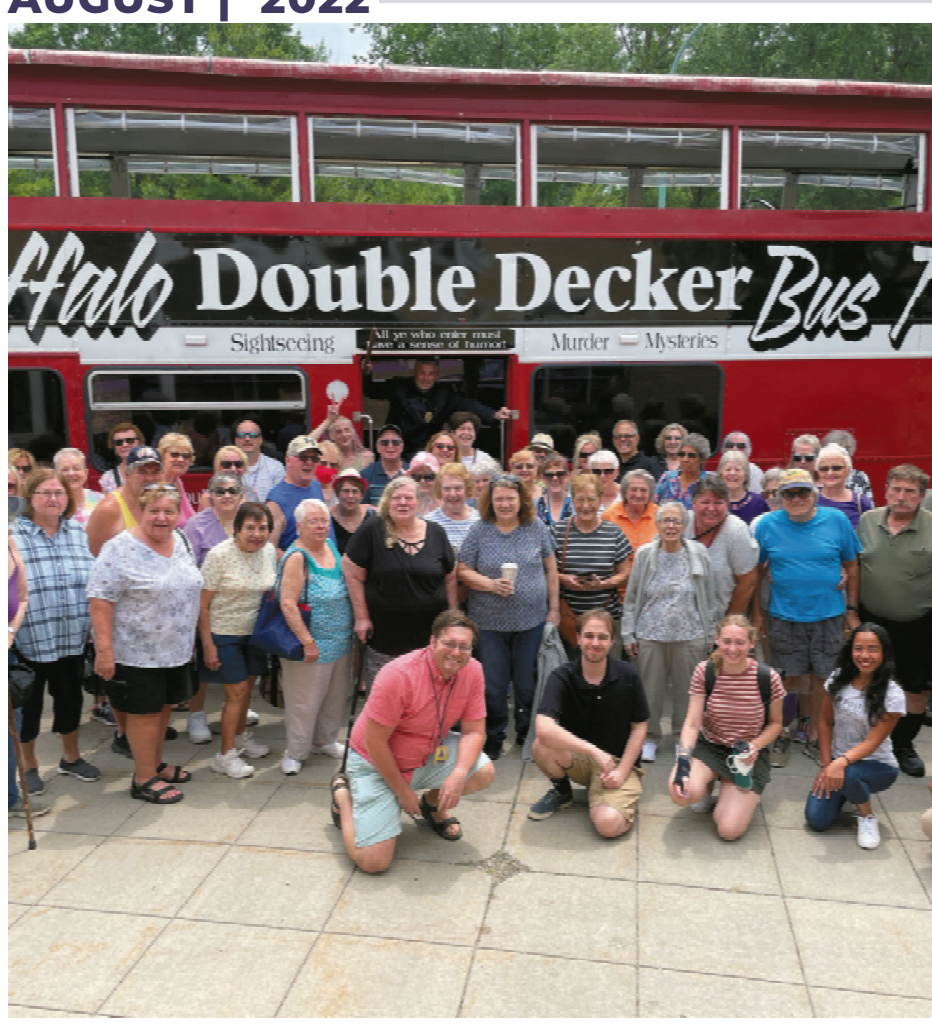
SBCA Members about to board the Buffalo Double Decker Bus Tour on June 15th at Tosh Collins Center.