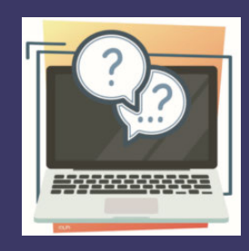
Aug Computer Classes | p 8