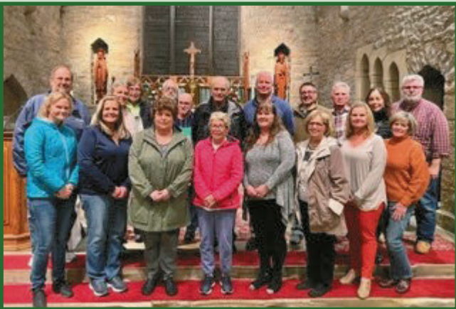
The Lay Ministers of the Eucharist gathered this week for a meeting and it was planned that we meet as a group every 3rd Wednesday of March and September. These ministers are ex-officio members of the Worship Commission of the Church. We pray for each other so that the religious piety we show in public worship finds its completion in the holiness of life that we live.