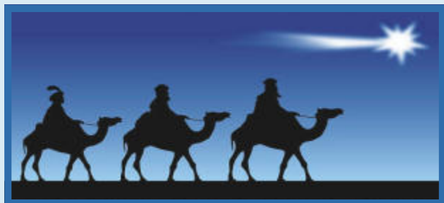
The wise still seek Him

Next Sunday: Is 42:1-4, 6-7/Ps 29:1-2, 3-4, 3, 9-10 [11b]/Acts 10:34-38/Lk 3:15-16, 21-22 or, Is 40:1-5, 9-11/Ps 104:1b-2, 3-4, 24-25, 27-28, 29-30 [1]/Ti 2:11-14; 3:4-7/Lk 3:15-16, 21-22