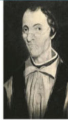
Fr. Gabriel Richard

FAMILIES OF PARISHES Rise From The Ashes 38-MILE PILGRIMAGE FRIDAY, JULY 22ND – SUNDAY, JULY 24TH