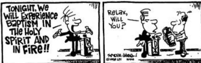
BAPTISM OF THE LPRD

In 2022 we want to celebrate the life events and successes of our parishioners. If you are interested in sharing personal life events with the Gesu community please send an email to communications@gesudetroit.org . We look forward to hearing your stories!