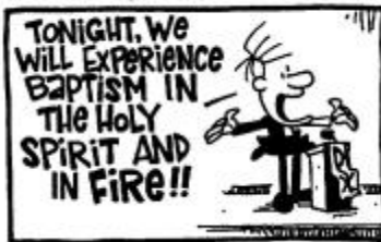
BAPTISM OF THE LORD