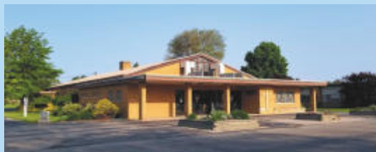
Holy Innocents- St. Barnabas