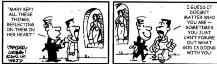
MARY, MOTHER OF GOD