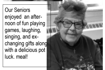
Our Seniors enjoyed an afternoon of fun playing games, laughing, singing, and exchanging gifts along with a delicious pot luck meal!