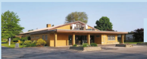
Holy Innocents-St. Barnabas