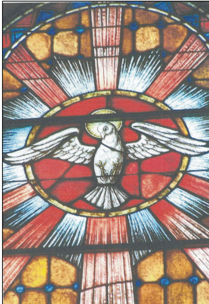
Pentecost Window at St. Veronica Church