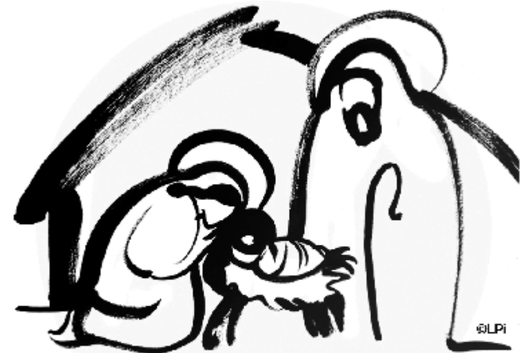
The Nativity of the Lord