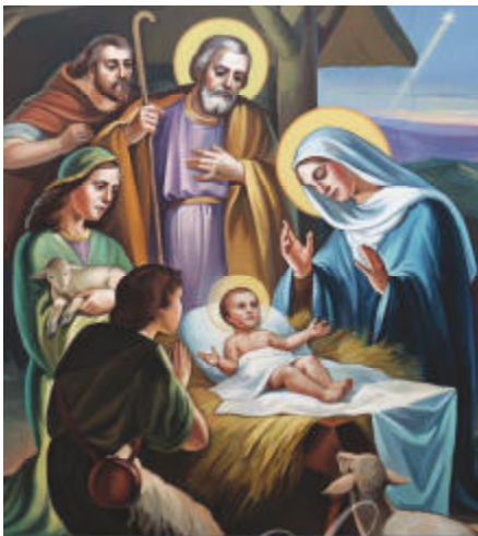
The Nativity of the Lord