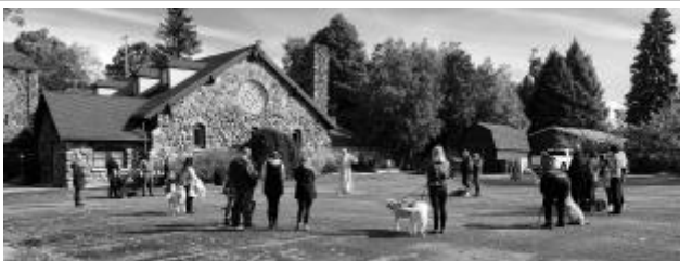
Thank you all who attended our annual pet blessing. We had a such a great turn out with all of Gods creatures! We look forward to seeing you all next year.