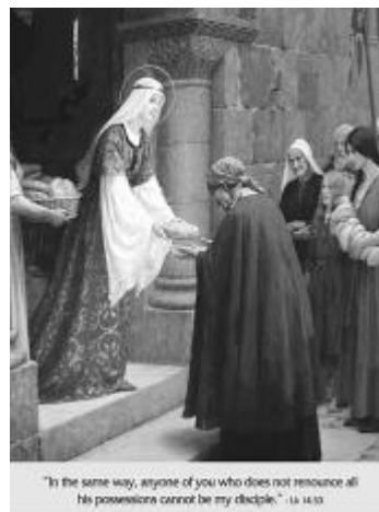
"In the same way, anyone of you who does not renounce all his possessions cannot be my disciple." -Lk 14:33