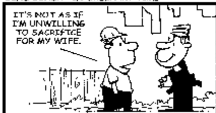
22ND SUNDAY IN ORDINARY TIME

"If you only pray when you're in trouble ... you're in trouble."