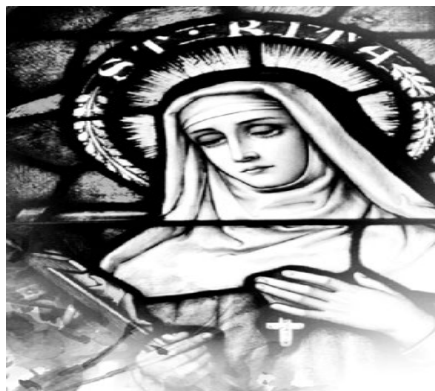
ST. RITA of CASCIA "Saint of the Impossible" MAY 22

11:00 am The Religious ministering within the Archdiocese of Detroit