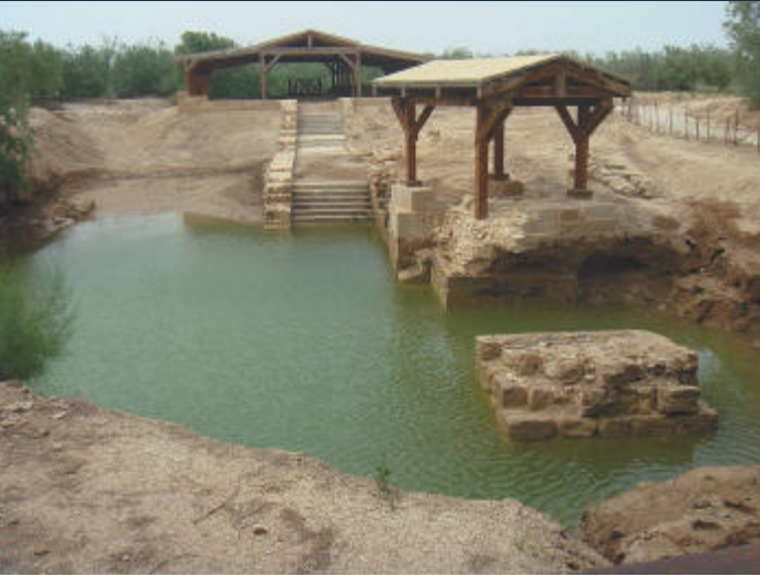
The Al-Maghtas Ruins

on the Jordanian side of the Jordan River was the location for the Baptism of Jesus and the ministry of John the Baptist. CC BY 2.5.