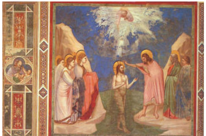
Baptism of Christ

Next Week: Week of Prayer for Christian Unity